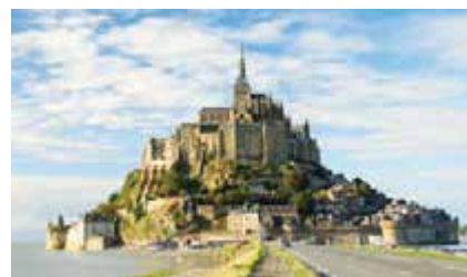
Mont Saint-Michel, France

On the 6th June 1944, the largest invasion ever mustered landed on the coast of Normandy and you'll be guided through the events of that day before heading to the excellent Caen Museum or the town of Bayeux, home to the world-famous tapestry. With its sharp spires and fortifications, Mont Saint-Michel's abbey and narrow streets will transport you back to the Middle Ages.