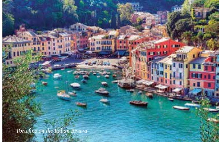
Portofino on the Italian Riviera