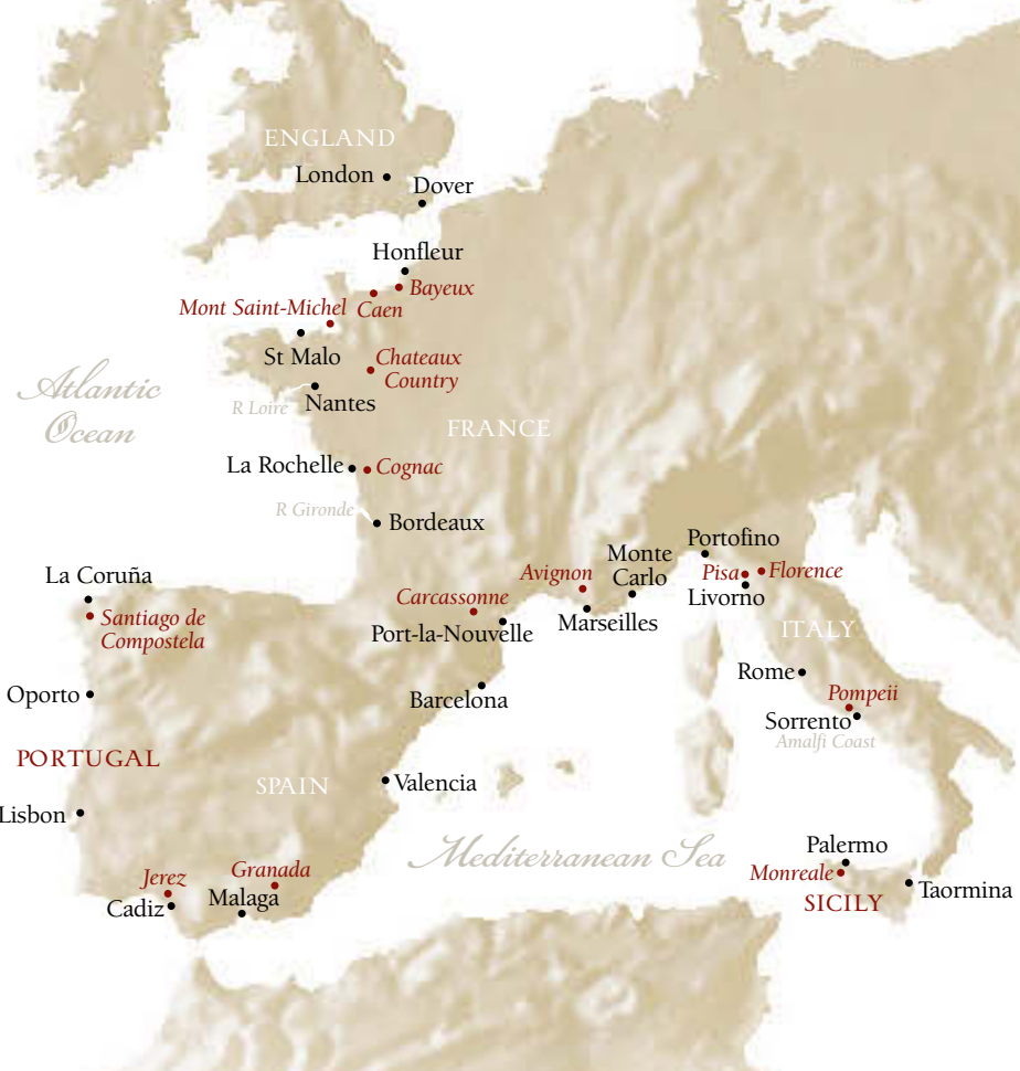
Begin with 2 nights in London

From Nantes, enjoy an overnight visit to the spectacular Loire region with its elaborate chateaux and La Rochelle where you can discover the secrets of the Hennessy Cognac distillery. Next, cruise up the River Gironde to Bordeaux. Admire the city's 18th century architecture before heading to a prestigious wine estate for a tasting.