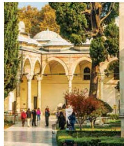
Topkapi Palace, Istanbul

End your cruise with a 2-night hotel stay in Istanbul where sightseeing takes in the Byzantine 6th-century cathedral of Hagia Sophia, the Topkapi Palace and the Sultan Ahmet Camii (Blue Mosque). You are then free to explore the city – perhaps visit the amazing underground cisterns or Archaeological Museum. It's the ideal opportunity to make your souvenir purchases in the city's colourful market – but don't forget to haggle!