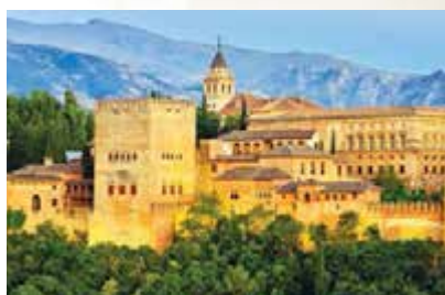
Alhambra Palace, Granada

Cadiz was the gateway to the New World and its Old Town reflects the city's rich history. After your tour, drive inland to Jerez de la Frontera to visit one of the famous bodegas for a sherry tasting. From Malaga, visit the Alhambra in Granada,