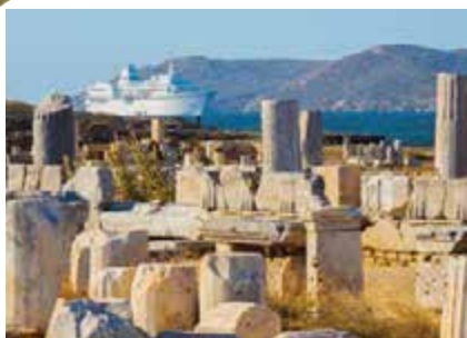
Cruise to the heart of the ancient world, Delos

Alternatively, you can take a ferry across the Dardanelles to commemorate a more recent conflict and the moving memorials of Gallipoli.