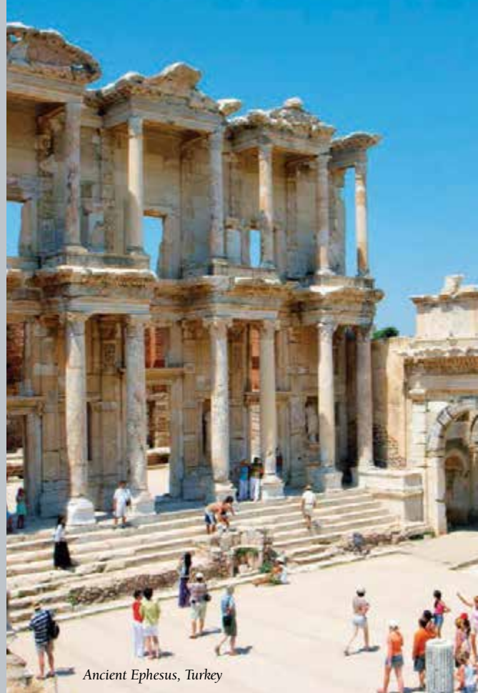
Ancient Ephesus, Turkey