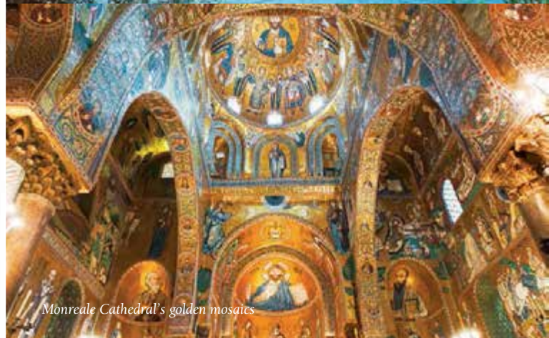
Monreale Cathedral's golden mosaics

mosaics of Monreale Cathedral and the Greek theatre at Taormina.