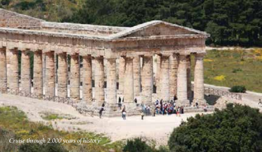
Cruise through 2,000 years of history