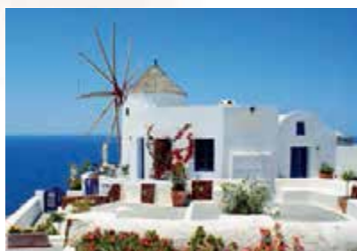
Santorini, Greek Islands

From Piraeus, enjoy a guided tour of the Acropolis and its Museum before sailing to sacred Delos – one of the most interesting archaeological sites in Greece – and lively Mykonos for a perfect contrast.