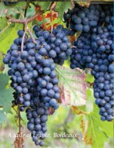
A taste of France, Bordeaux